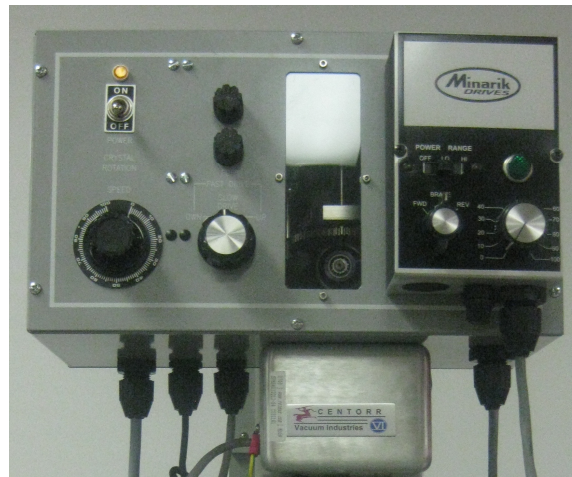
Series 3 Crystal Puller Control Panel

Centorr/Vacuum Industries Manufactures a complete line of High Temperature Vacuum and Controlled Atmosphere Furnaces for the Research and Development Laboratory, the Materials, Testing and Evaluation Laboratory, and for Production.