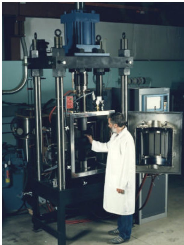
Model HP-12.5x14-W-M-10S7-A-17 100 Ton Post and Platen Vacuum Hot Press with refractory metal hot zone.